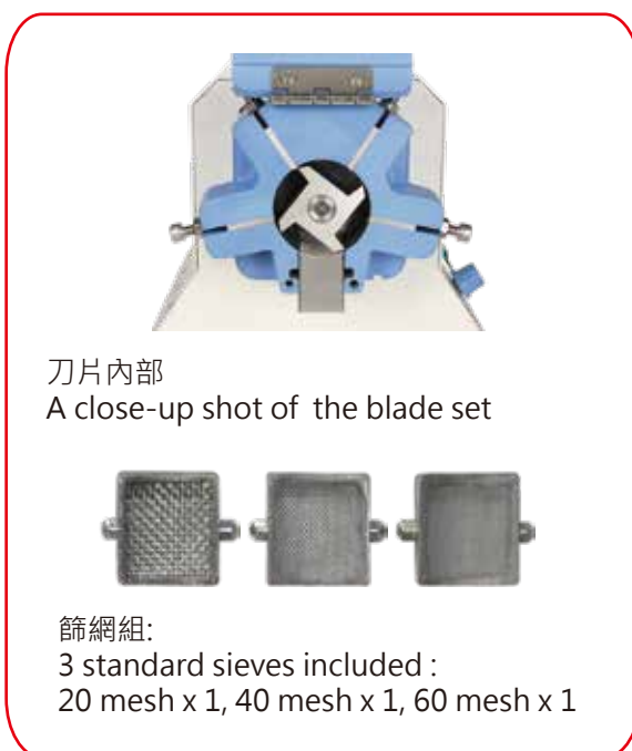
刀片內部 A close-up shot of the blade set