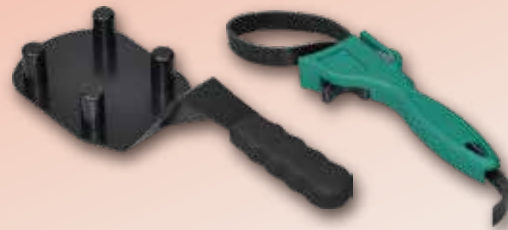
杯座拆裝工具組 (選購品) container dismantling tool set (Optional purchase)