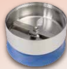
大容量粉碎杯(200ml) Large cap. container