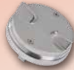
微量蓋 (選購品) Extra lid (Optional purchase)