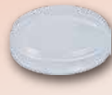
透明蓋 (選購品) Transparent lid (Optional purchase)