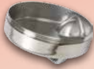
大容量蓋 Large cap. lid