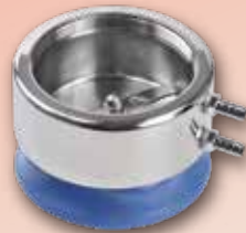
冷卻型粉碎杯(150ml) Cool type container