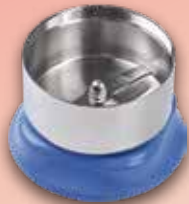
標準型粉碎杯(150ml) Standard container