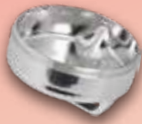
標準蓋 Standard lid