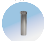
GT-1 / GT-2 GT-4 / GT-5