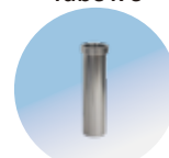
GT-1 / GT-2 GT-4 / GT-5