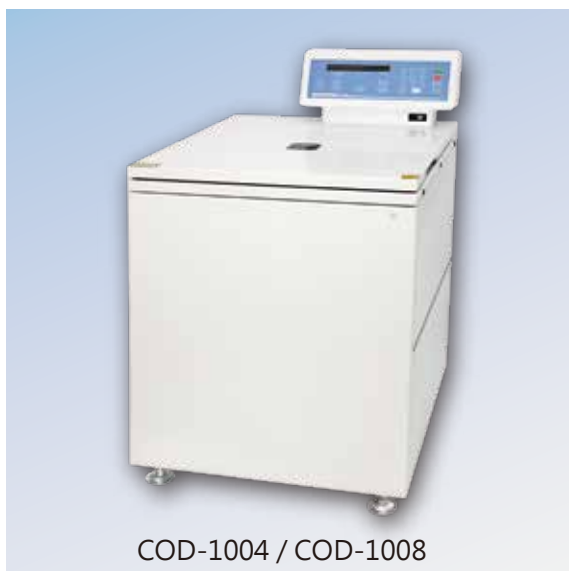
COD-1004 / COD-1008