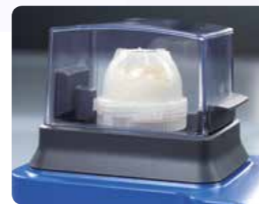
Step 4 | Grinding the sample