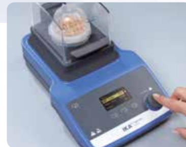
Step 3 | Start the milling process