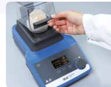
Step 5 | Remove the grinding chamber