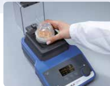
Step 2 | Attach the grinding chamber onto the Tube Mill