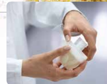
Step 6 | Remove the grinding sample