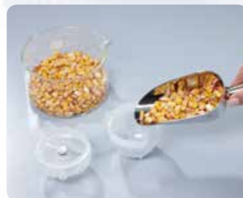
Step 1 | Fill the sample in the grinding chamber