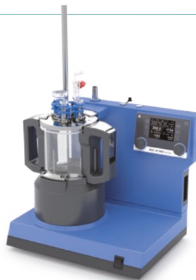
LR 1000 control Laboratory Reactor Ident. No. 0010001035

If required, the following IKA devices are available for your lab to enhance your T 25 easy clean disperser experience: