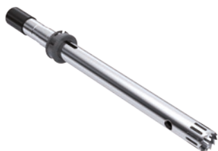
S 25 EC-C-18G-ST Dispersing tool

Cleaning status for easy clean: By turning and lowering the clamp, the shaft and rotor can be dropped until the whole rotor comes out of the stator. Working volume: 10 – 1,500 ml. Bearing with ceramic plain bearing. Suitable for solvents, sterilizable. Ident. No. 0025002580.