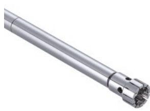
S 25 KV - 25 F Dispersing tool

Cleaning status for easy clean: By turning and lowering the clamp, the shaft and rotor can be dropped until the whole rotor comes out of the stator. Working volume: 10 – 1,500 ml. Bearing with ceramic plain bearing. Suitable for solvents, sterilizable. Ident. No. 0025002580.