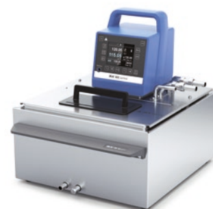
ICC control pro 12 c Immersion circulator Ident. No. 0010000417