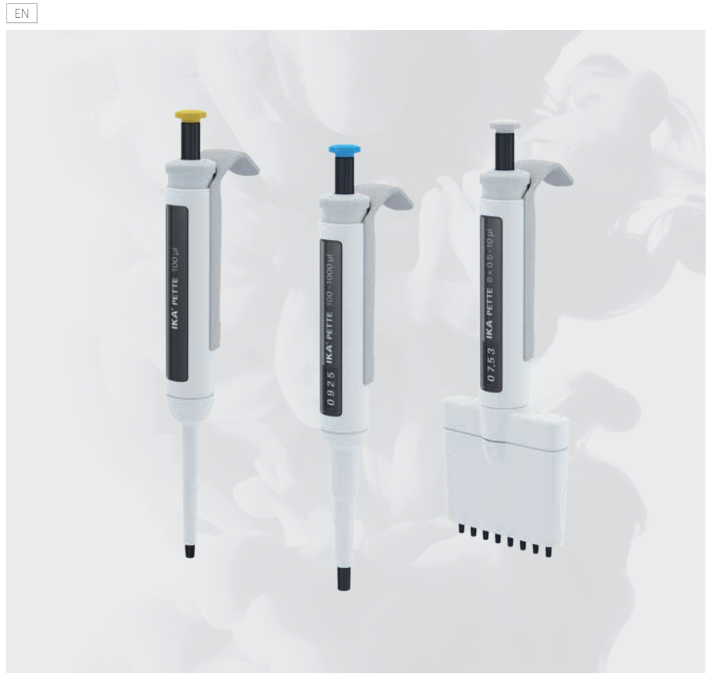
PRECISE DISPENSING | IKA PETTE fix, vario and multi