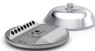
G-L PCR 0.2 mm Strip Set Accessory G-L Ident. No. 0030001334