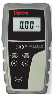
COND 6+ handheld conductivity meter