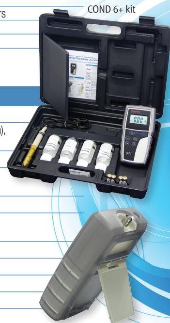
Protective rubber armor with benchtop stand