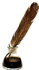
Inks Liquid & Paste