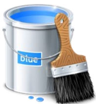
Paints and finishes