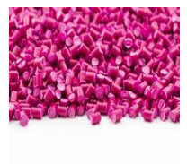
Plastics and Resins